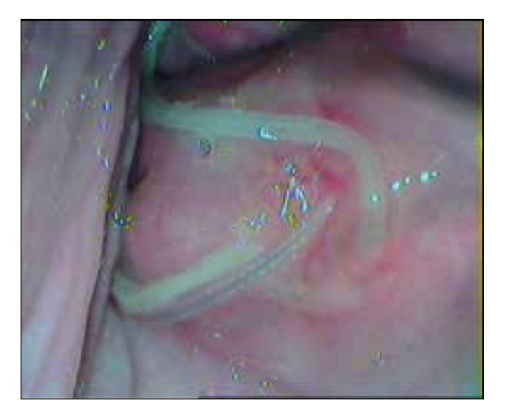
Fig. 5. Presence of ascaris in the vagina for 30 days in patients with complicated postpartum period.

reveal unfertilized eggs of ascaris, in the examination of the general blood test up to 20% observe a slight increase in ESR and the number of rod-core leukocytes.