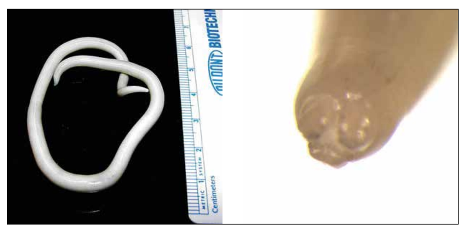
Fig. 1. Close up front end of adult A. lumbricoides.

Fig. 2. Ascaris lumbricoides unfertilized eggs.