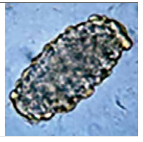
Fig. 3. Fertilized egg of A. lumbricoides in unpainted moist feces, with embryos at an early stage of development, 200x magnification. Lumbricoides without shell, fertilized egg in moist feces, 200x magnification.

The migration period of the larvae lasts 12-14 days. Migration is a prerequisite for the larvae to develop pubescent ascaris, capable of secreting eggs. In excrement eggs ascarid appear two and a half months after the time of invasion. Ascaris are capable of parasitizing the adult intestine for no more than 12 months.