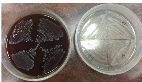
Photo2. Microorganisms growing on 5% sheep blood agar, meat peptone agar