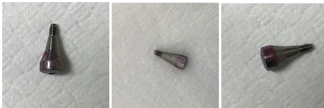
Photo 1. a) Cervical part of healing abutment is covered with biofilm; b) \frac{1}{3} of the healing abutment surface is covered with biofilm; c) more than \frac{1}{2} of the healing abutment surface is covered with biofilm.

covered with biofilm (Ph.1,b); more than \frac{1}{2} of the surface covered with biofilm (Ph.1,c).